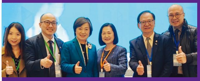
學院團隊與教育局局長蔡若蓮博士，JP（左三）合照。 The TWC team with Dr. the Honourable Choi Yuk-lin, JP (left 3), Secretary for Education.