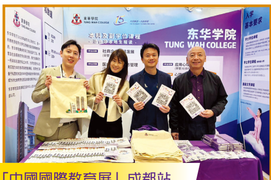
「中國國際教育展」成都站 CEE in Chengdu (6/11)