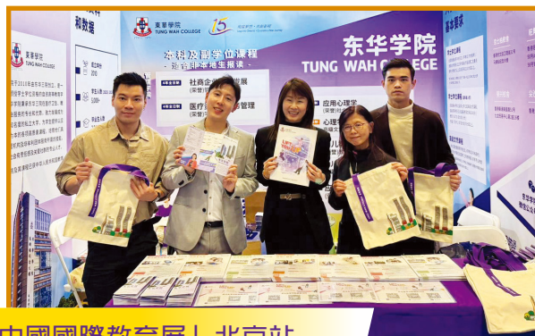
「中國國際教育展」北京站 CEE in Beijing (31/10-1/11)

To enhance its presence in the Chinese Mainland, TWC actively took part in the "China Education Expo (CEE) 2025" in Beijing, Chengdu, and Shanghai from October to November. During the occasions, TWC representatives engaged with prospective students and their parents in person, providing useful information about the programmes and admission application procedures at TWC.