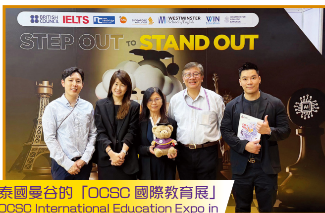
泰國曼谷的「OCSC 國際教育展」 OCSC International Education Expo in Bangkok, Thailand (15-16/11)

As part of its internationalisation strategy, TWC also joined the "OCSC International Education Expo" in Bangkok, Thailand for the first time, aiming to build its global profile and recruit more non-local students.