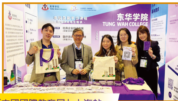
「中國國際教育展」上海站 CEE in Shanghai (9/11)